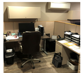
Pictured above: Office equipment recently donated for our residential locations.