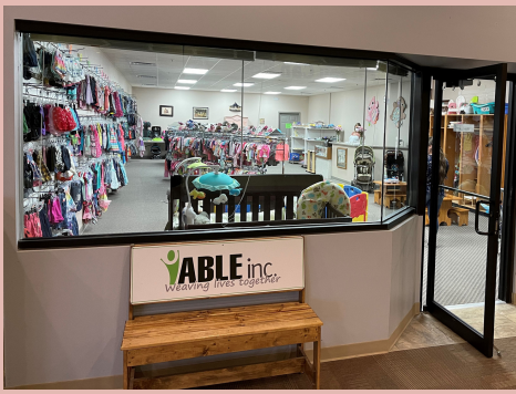
Pictured left: A view looking into Kid Thrift. Right: Beautiful kids formal wear. Racks of clothing with tags available for purchase.

In this newsletter: Pg 2 - AED maintenance Pg 3 - Transformation Earth Day Community Partner Pg 4 - Easter winners