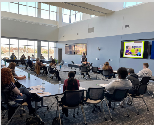
Our employees enjoying this large space at the new American Bank Center in Downtown Dickinson.