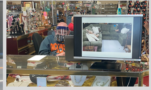
Mitch Hintz with the new display monitor.