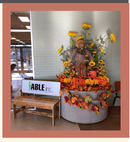
Above: New fall decor decorates the inside of the T-Rex mall.

Water from the recently repaired roof will be channeled directly into the sewer to avoid runoff and icy conditions in the lot. A large trench has been dug as work begins. Stay tuned for more as we serve our community and the people we support through our adventures at the T-Rex Plaza.